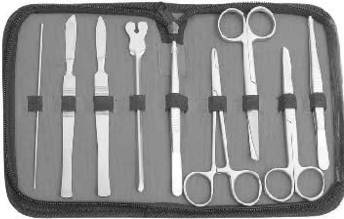
Dissecting Kit - Set of 9 Pcs YZ-300