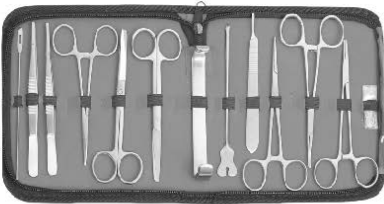
Dissecting Kit - Set of 13 Pcs YZ-303