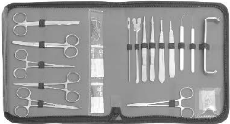
Dissecting Kit - Set of 20 Pcs YZ-305