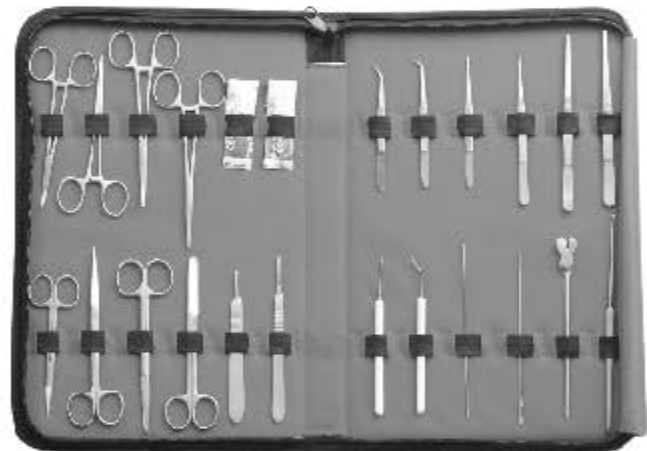
Dissecting Kit - Set of 42 Pcs YZ-307