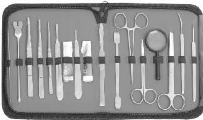
Dissecting Kit - Set of 17 Pcs YZ-306